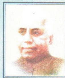
Late Shri. Yashwantrao Chavan Ex. Deputy Prime Minister, India

Walwa Education Society's YASHWANTRAO CHAVAN ARTS AND COMMERCE COLLEGE, URUN - ISLAMPUR